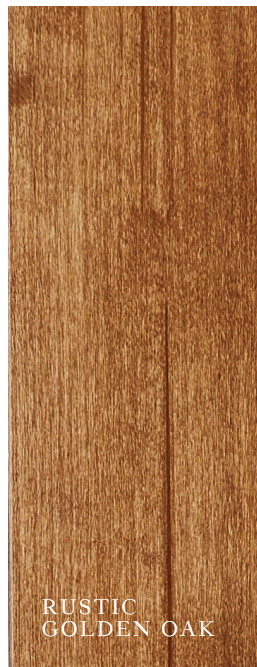
RUSTIC GOLDEN OAK